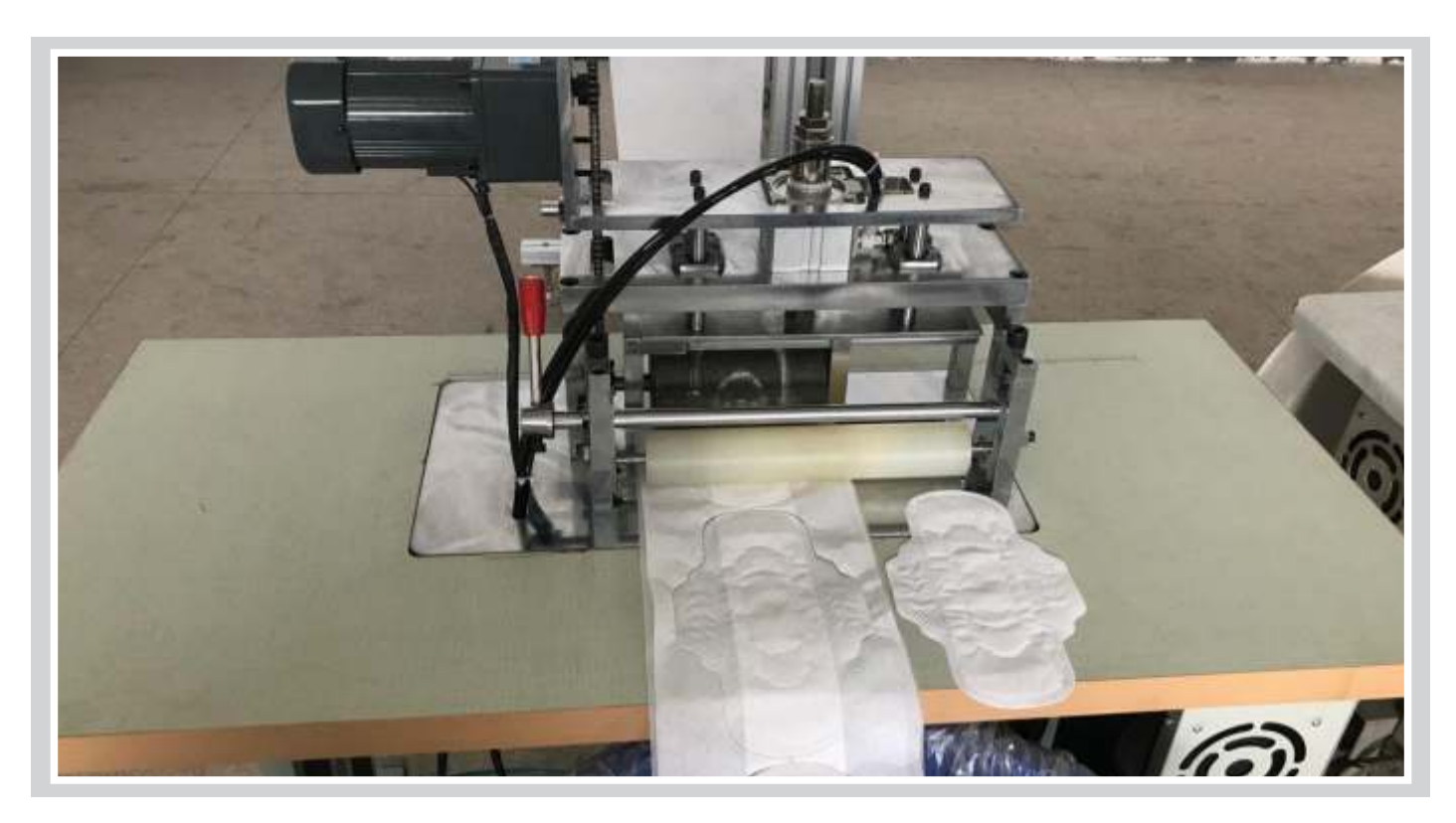
AUTOMATIC SANITARY NAPKIN MAKING MACHINE OS-ND80A